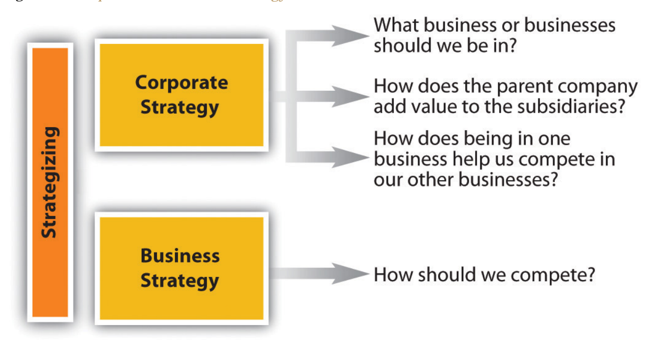
Figure 10.1 Corporate and Business Strategy

A strategy is the central, integrated, externally oriented concept of how a firm will achieve its objectives. Strategy formulation (or simply strategizing ) is the process of deciding what to do; strategy implementation is the process of performing all the activities necessary to do what has been planned. Neither can succeed without the other; the two processes are interdependent from the standpoint that implementation should provide information that is used to periodically modify the strategy. However, it's important to distinguish between the two because, typically, different people are involved in each process. In general, the leaders of the organization formulate strategy, while everyone is responsible for strategy implementation.